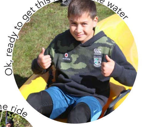
Ok, ready to get this kayak in the water