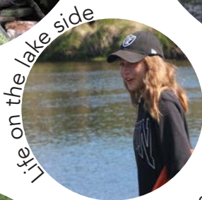
Lite on the lake side