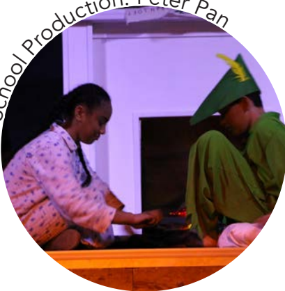
School Production: Peter Pan