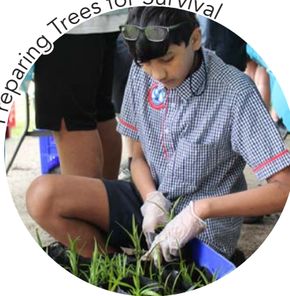
Preparing Trees for Survival