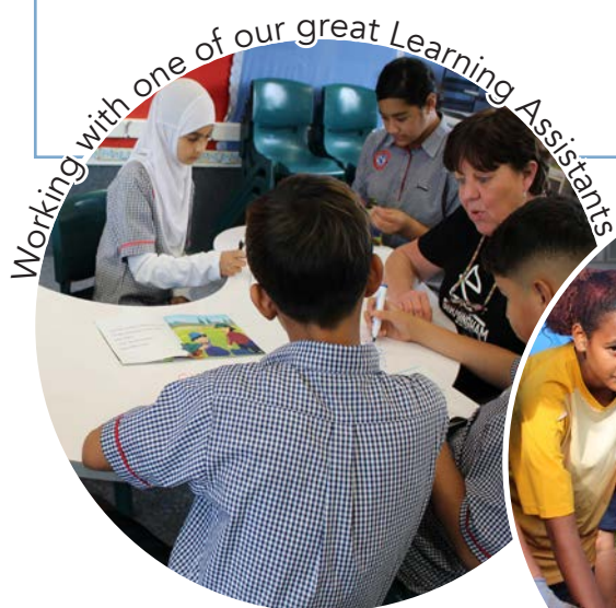
Working with one of our great Learning Assistants

The majority of students arrive at school with academic and social skills that enable them to manage independently and fully engage in their learning. At times, some students require extra support to ensure they can meet the required academic and social outcomes. Pakuranga Intermediate employs staff with the skills and understanding to match the needs of these students and assist them to gain success.