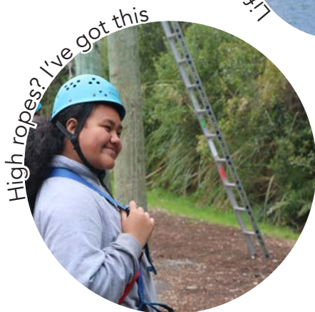
High ropes? I've got this