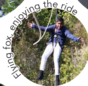
Flying fox, enjoying the ride