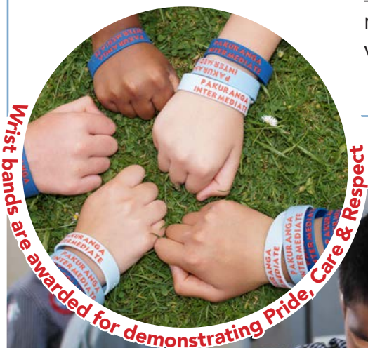
Wrist bands are awarded for demonstrating Pride, Care & Respect

Respect and Care are recognised and affirmed in a variety of ways.