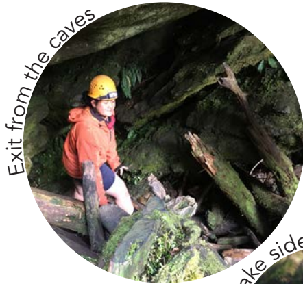
Exit from the caves

In addition to camp, we endeavour to have regular off-site learning experiences. Like camp, these often form memories that the students treasure for many years. However, the main purpose around these excursions is to put the classroom learning into a real context, improve engagement and build experiences that further learning can be built around.