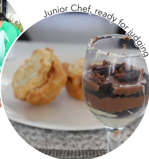
Junior Chef, ready for judging