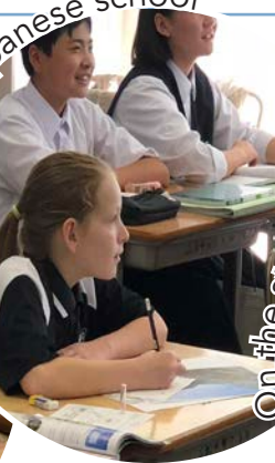
Lessons in a Japanese school