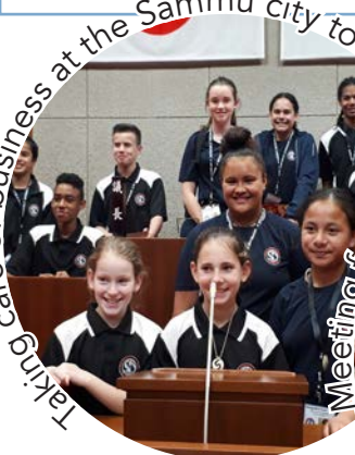
Taking care of business at the Sammu city town-hall.