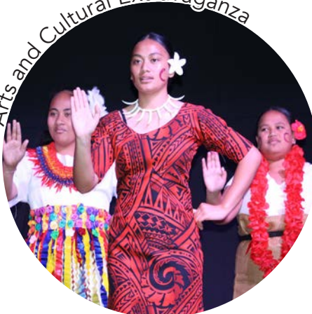
Arts and Cultural Extravaganza