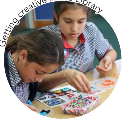
Getting creative in the Library