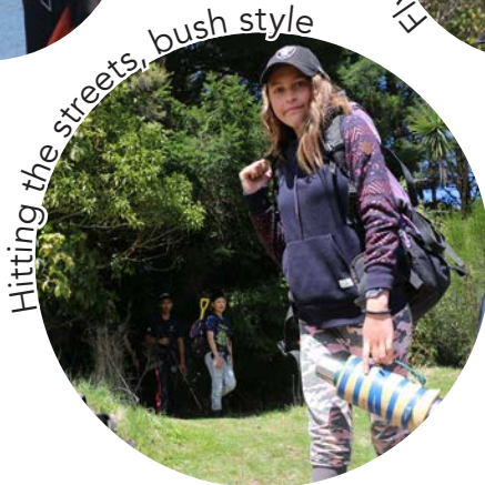
Hitting the streets, bush style