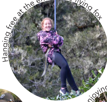
Hanging free at the end of the flying fox